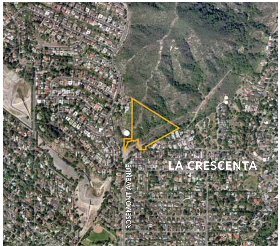
The planned Rosemont Preserve is situated at the top of Rosemont Ave. in La Crescenta, in the mouth of Goss Canyon.